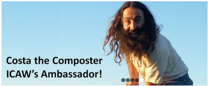
Costa the Composter ICAW's Ambassador!

Green Cleaning workshop Date: 22 nd March 13th Time: 1:00 pm – 3:00 pm Location: Marayong Community Centre,