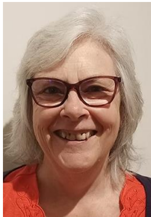
Lynne Seed Savers