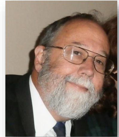
Nev Website / Resources