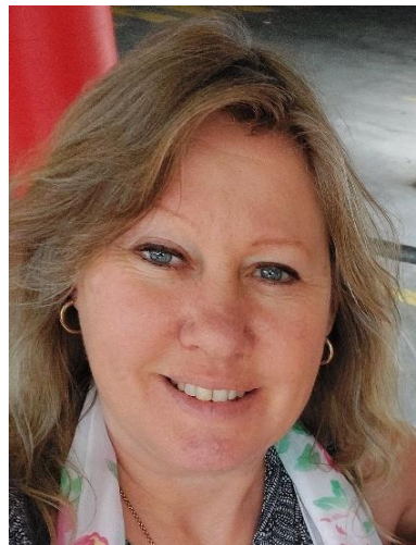
Sonia Living Skills