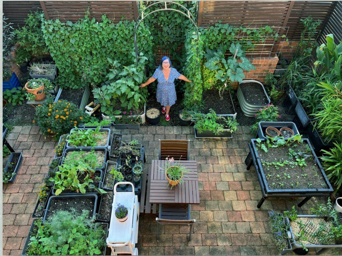
220 varieties of plants in this Sydney based edible garden